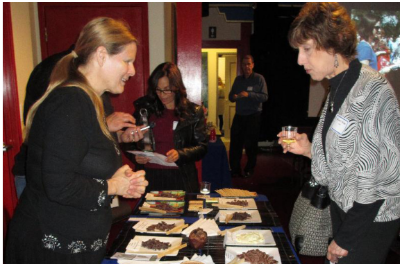
Chocolate tasting at "A Woman's Worth"

2012 was a milestone year for The Greater Contribution (TGC). As the year 2012 came to a close, TGC had funded its 7500th micro loan since its inception in 2006. These small loans have impacted over 39,000 lives. Women and their families are now enjoying better meals, better health, providing education for their children and have a sustainable income for their future. Our data continues to show how much our borrowers' lives improve due to the accessibility of a continued source of micro loans.