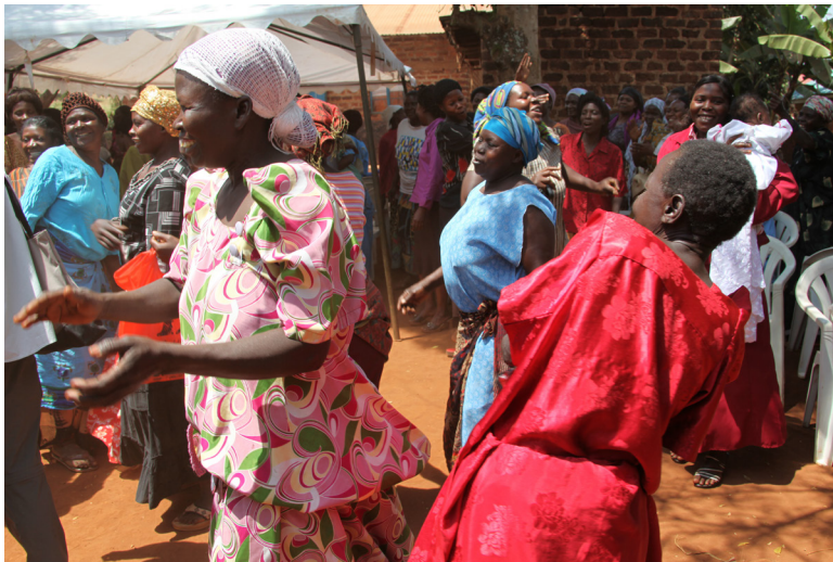
Singing and Dancing their Gratitude.