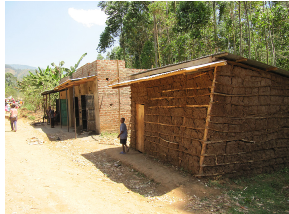
Typical Ugandan mud & wattle house.

Village. TGC's micro loan program was at work when they arrived. A training session for first time borrowers was taking place. As the five women visitors approached the group of borrowers, the women borrowers erupted into a welcome song and dance. Gratitude for the loans was expressed over and over again. It was a gratifying moment, a moment where hope was revealed.