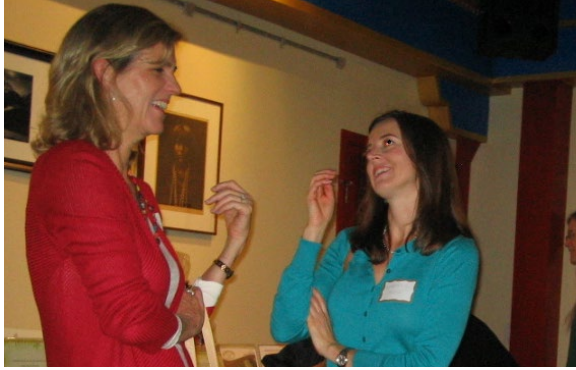
"A Woman's Worth" Event Attendees