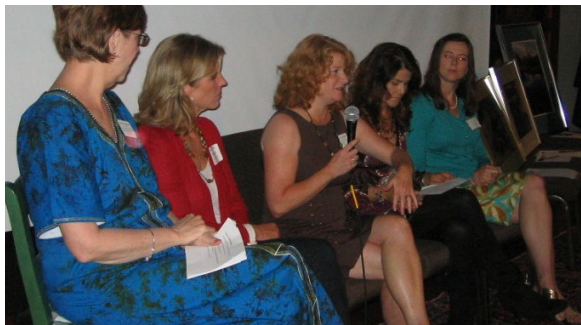
"A Woman's Worth" Event Speakers