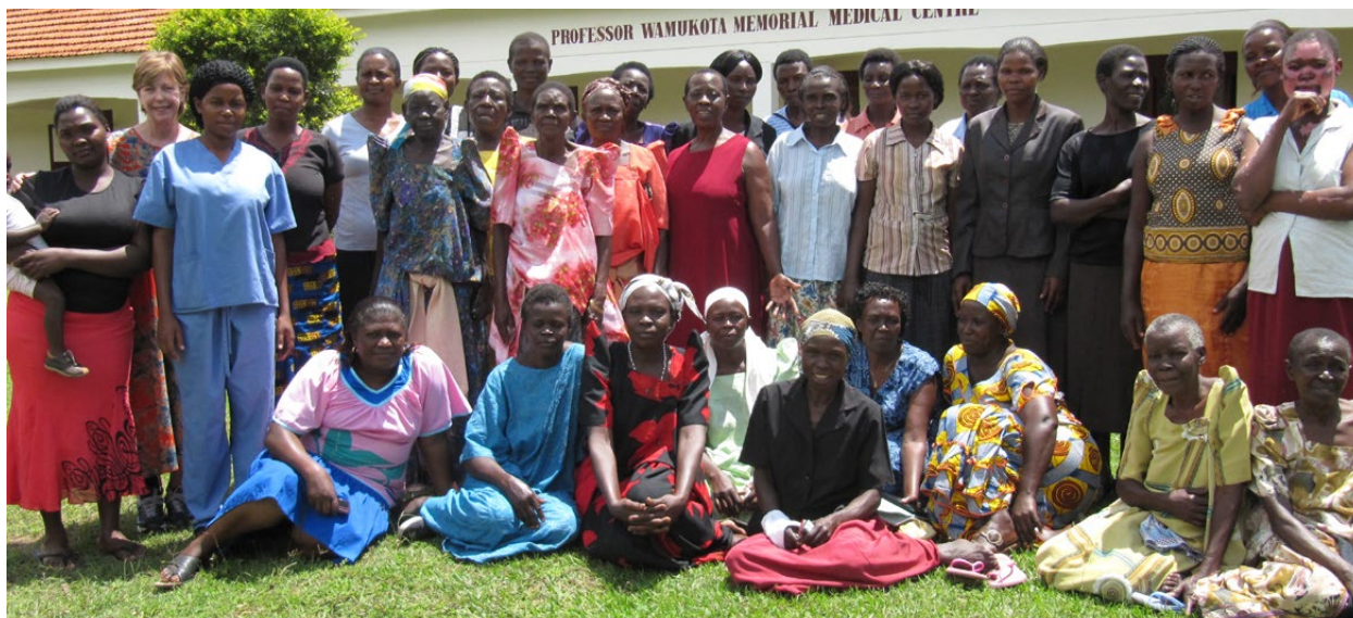
Lwaboba - New 2014 borrowers